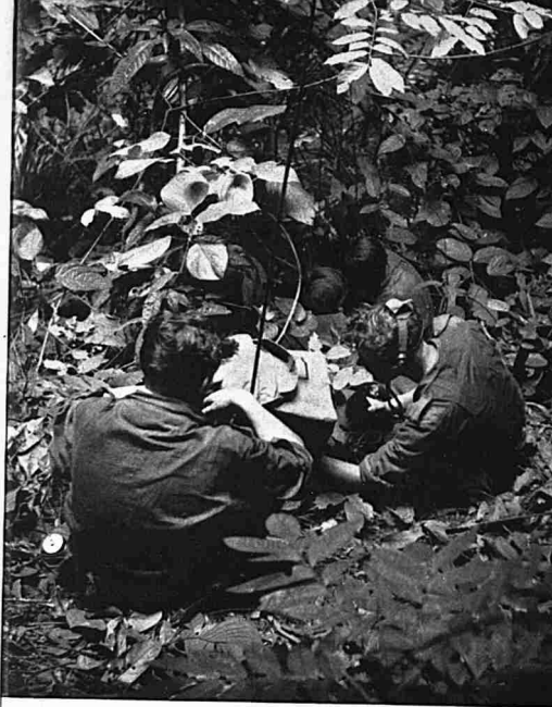
4 The struggle to get through to H.Q. on the radio