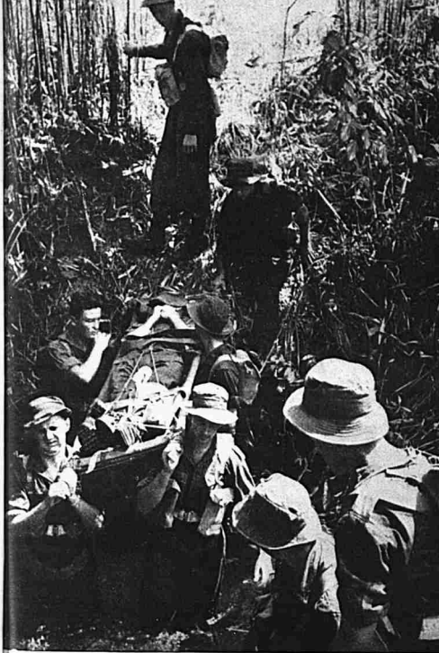
6 Evacuating a wounded man