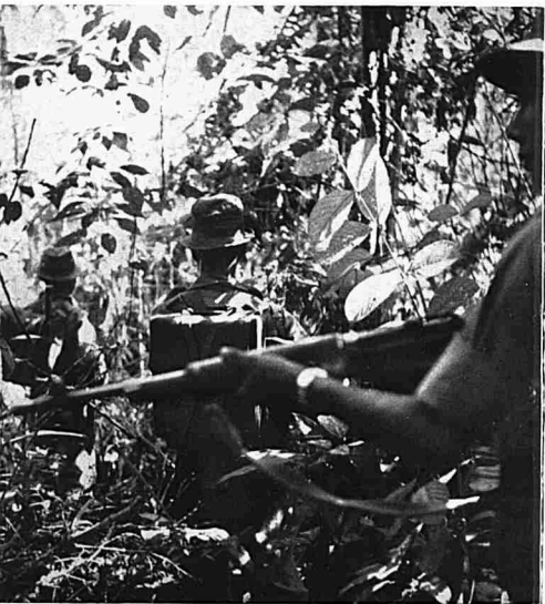
1 A patrol approaches a clearing